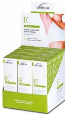
One Week Deodorant Cream display 01569