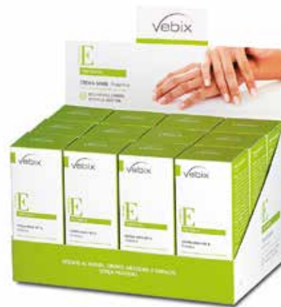
Hand Cream display 01556