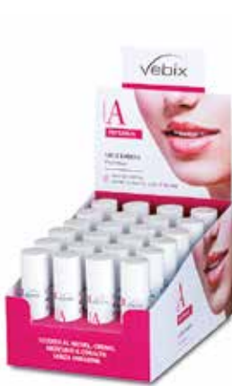
Lip Stick counter display 01555